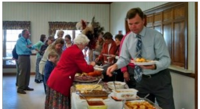
Central Family Giving Thanks at the November 6 Dinner