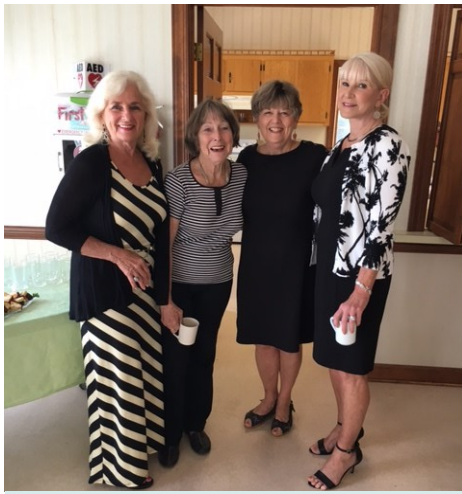
Four friends enjoying laughter & friendship during refreshment time.