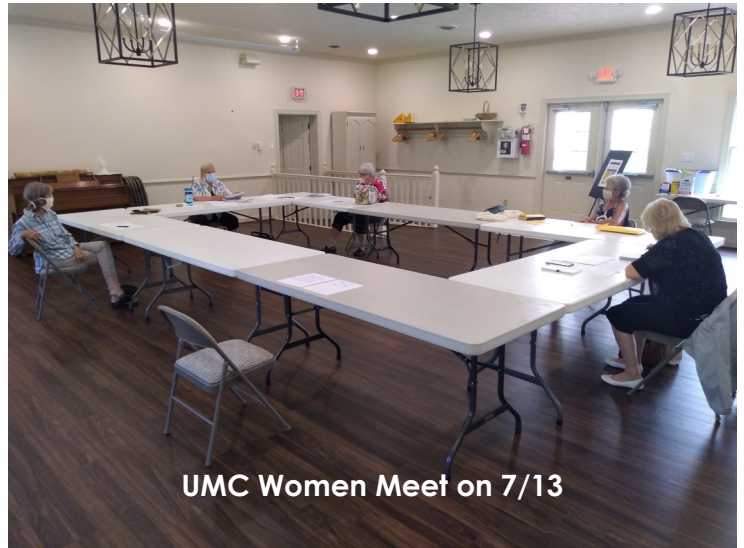
UMC Women Meet on 7/13

The Central United Methodist Women were finally able to meet on Monday, July 13th. We were originally scheduled to meet outdoors behind the Parsonage but it rained so we met in the Fellowship Hall. Social Distancing and Masks were the order of the day.