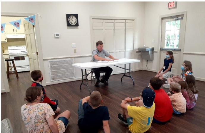
Top Left: Game time, Top Right: Snack time