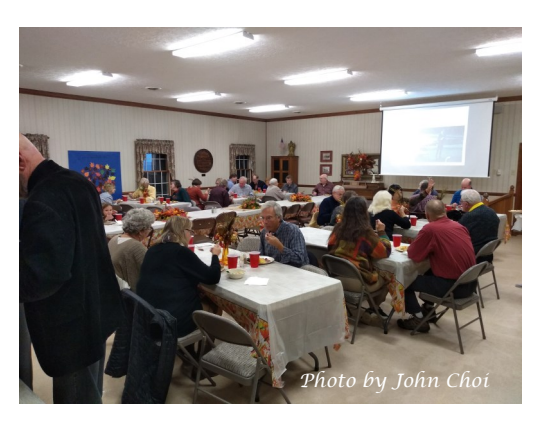
Thanksgiving Supper at Central