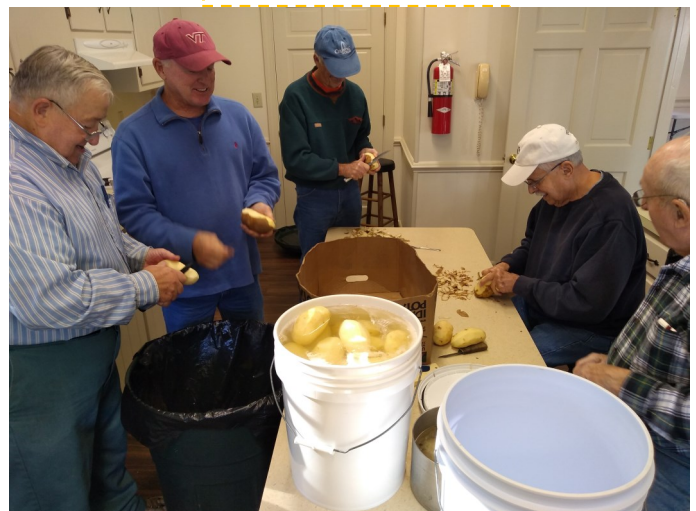
Preparing for UMM Brunswick stew sale

Enjoy soup, bread & cookies in a beautiful handmade pottery bowl for $15.