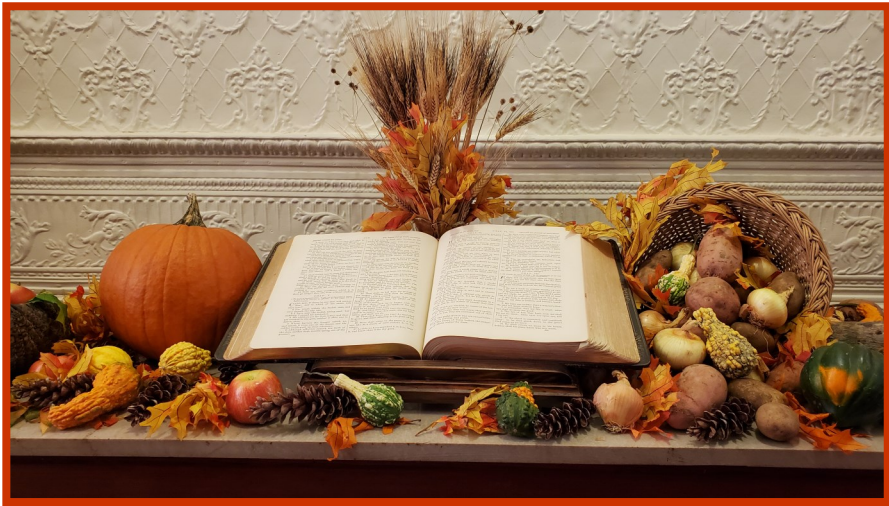
Beautiful Harvest Table by Mark Lewis