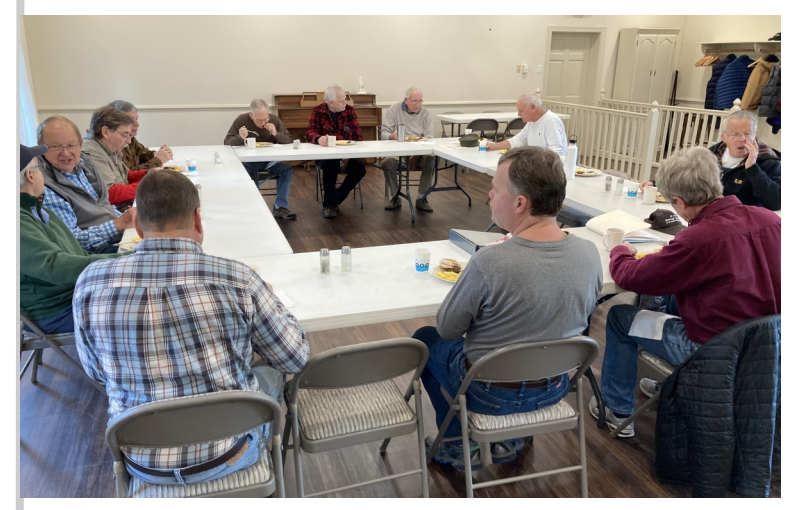
Above: United Methodist Men meet on Jan. 21 during their monthly meeting to discuss plans for 2023.

(Join them every month on the 3rd Saturday at Central.)