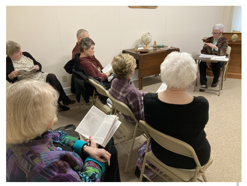
Friendship Sunday school class (1/22)