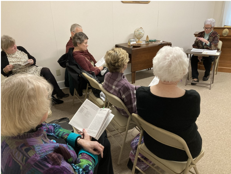
Friendship Sunday school class (1/22)