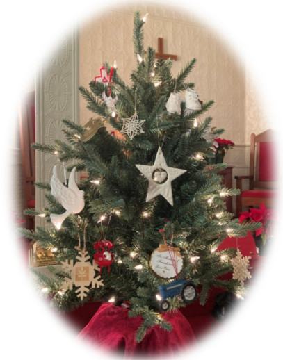
Tree of Remembrance