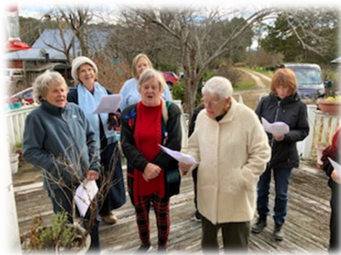
Photo at left: Beautiful Sanctuary Photo above & below: UMW caroling