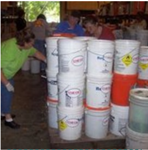
Kits in Sager Brown Depot, in Louisiana