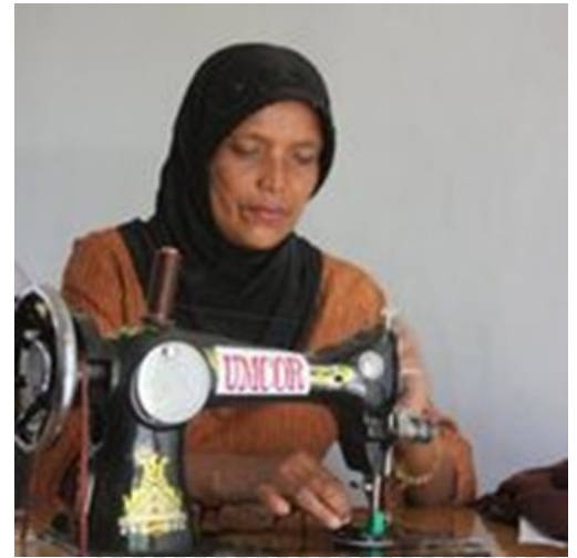
UMCOR Work in Banda Aceh, Indonesia following a Tsunami