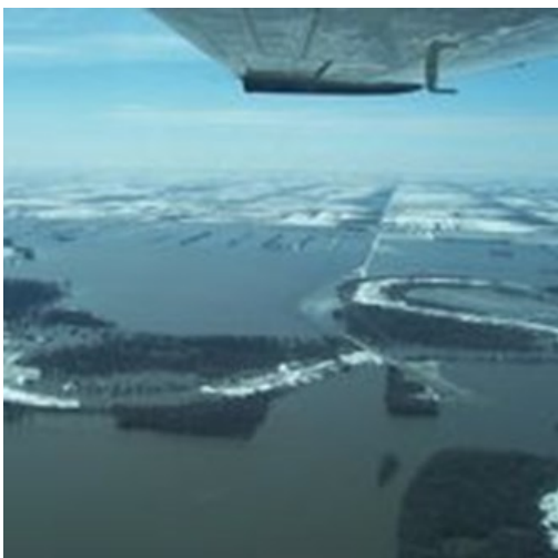
Floods in North Dakota