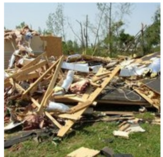
Spring Storms 2011