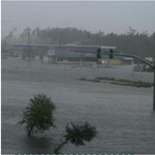
Hurricane Isaac - Gulf