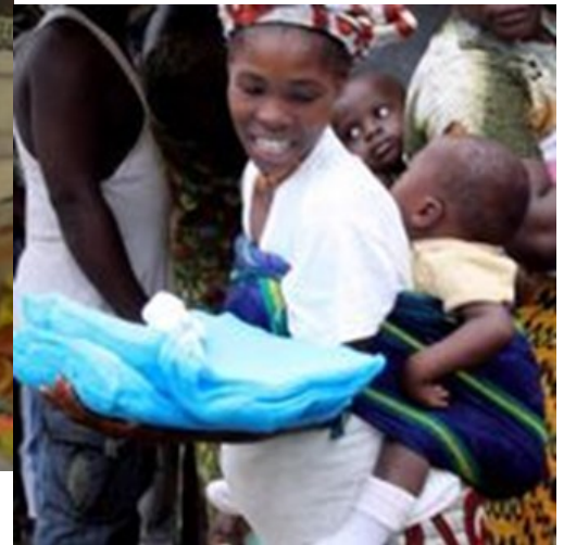
World Malaria Day April 25