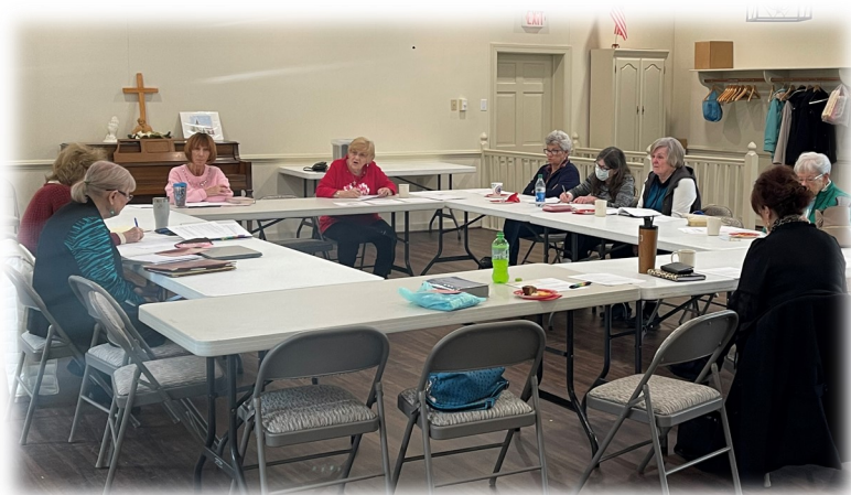
United Methodist Women meet (2/12)