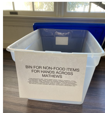
Non-Food items collection bin in the Fellowship hall or in the vestibule.