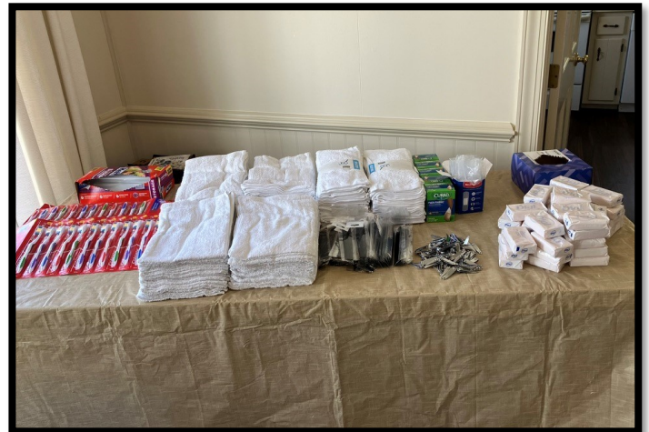
Unassembled UWIF Hygiene Bags