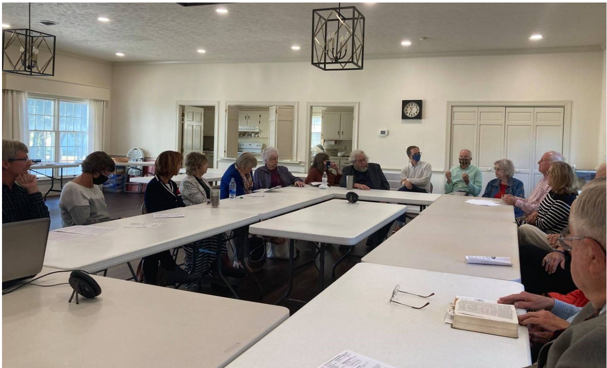
Photo above: On a recent Sunday, a couple of Sundays School classes came together for a joint meeting. The biblical virtue of kindness was the topic of the day.