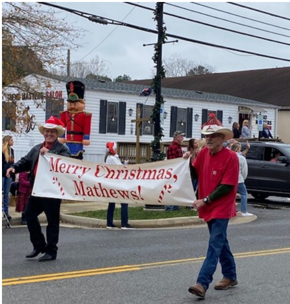
Photo from the 2021 Christmas Parade