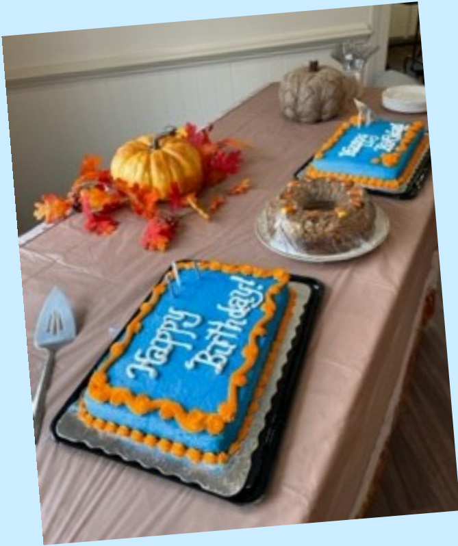
Birthday Luncheon October 23