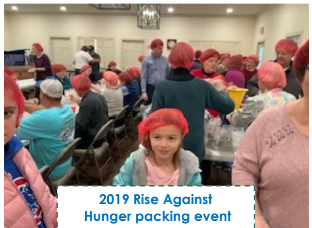
2019 Rise Against Hunger packing event