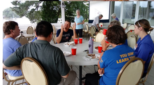
Annual Church picnic (8/7, photos by Louise Witherspoon)