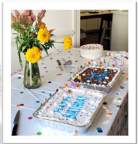
Annual Birthday Lunch Hosted by UM Women