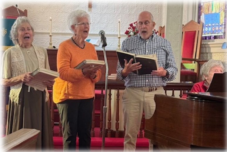
The Trio Sings (10/13)